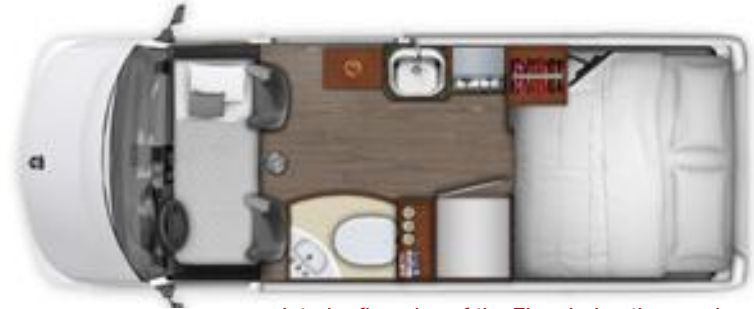
Interior floorplan of the Zion during the evening