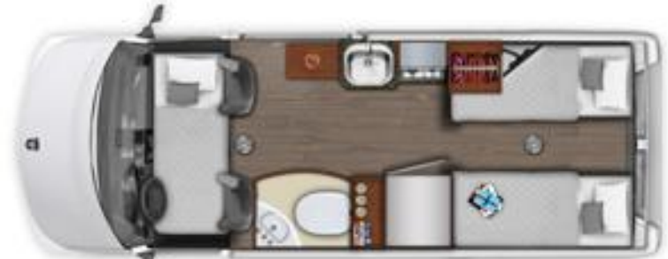
Alternate interior floorplan of the Zion during the evening