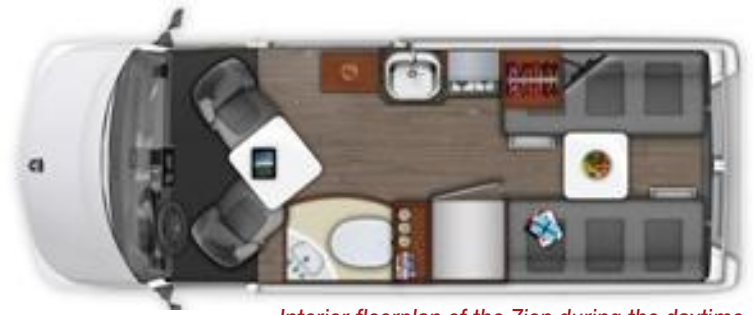
Interior floorplan of the Zion during the daytime

Take a step into your beautiful new Zion by Roadtrek. As you turn from your driver's seat, you'll find a pop-in table to enjoy a card game or a nice meal. Looking ahead to your kitchen, you'll be able to prepare a delicious meal on your 2-burner propane stove, and keep your groceries fresh in your 5 cu. ft. refrigerator. You'll have ample storage space in the kitchen including a pull-out pantry and a deep pot drawer. As you make your way through the galley, you'll find a comfortable and spacious permanent bathroom with stand-up shower, and finally arrive to your power composite leather sofa that converts into a king or two twin bed(s). End your day relaxed; watching your favorite movie on the 24" flat screen HD television.